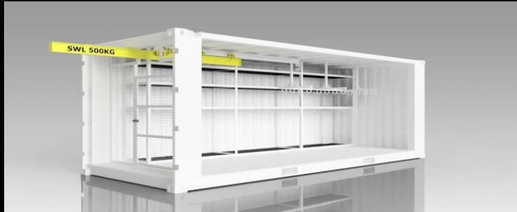
Special BS EN ISO 10855 / DNV2.7-1 Workshop Containers