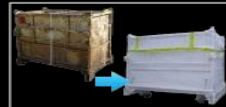
REPAIR & RE-CERTIFICATION