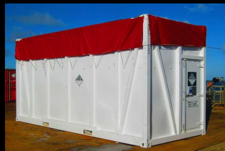
Open Top/Generator Containers