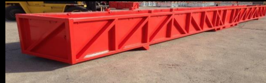
Special Freight Baskets