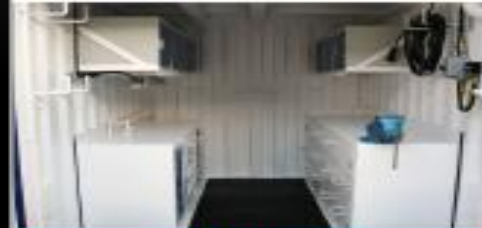
SPECIALIST OFFSHORE CONTAINERS