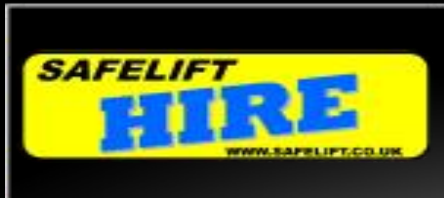
SHORT & LONG TERM EQUIPMENT HIRE