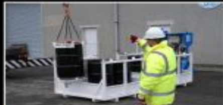
ENVIRONMENTAL PRODUCT SUPPLY