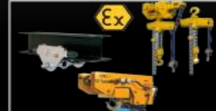
DECOMMISSIONING PROJECT SUPPLY