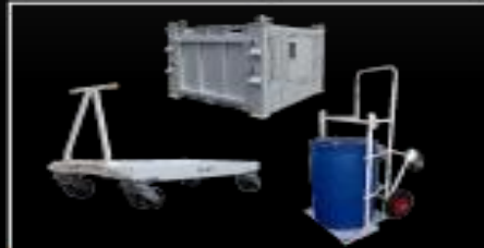
MANUAL & MECHANICAL HANDLING EQUIPMENT