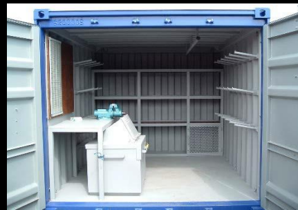
Rigging Loft Containers